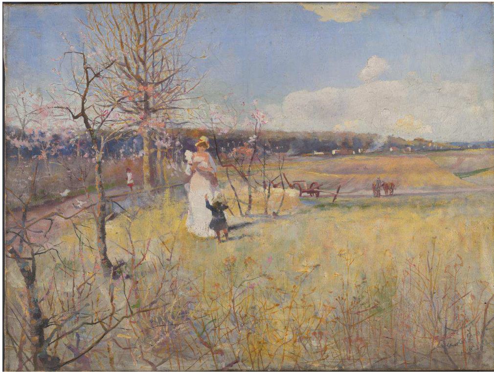
Above: Springtime 1888 by Charles Condor