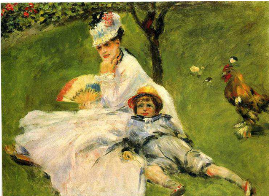
Camille Monet and her son Jean in the Garden at Argenteuil by Pierre August Renoir 1874